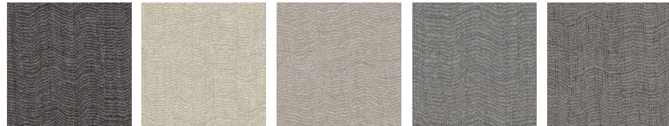
DN2-VNO-26 Midnight Rain DN2-VNO-27 Belon DN2-VNO-28 Giselle DN2-VNO-29 Cooppella DN2-VNO-30 Zaitun