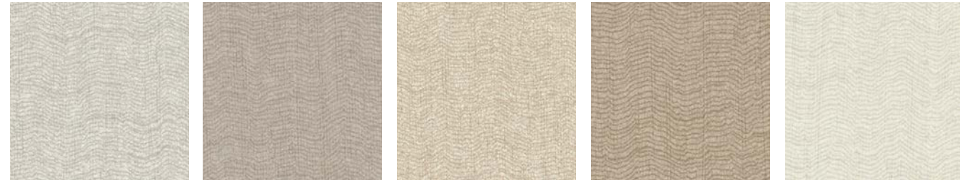
DN2-VNO-04 White Essence DN2-VNO-05 Linen Silk DN2-VNO-07 Callamoon DN2-VNO-08 Alpaca DN2-VNO-20 En Pointe