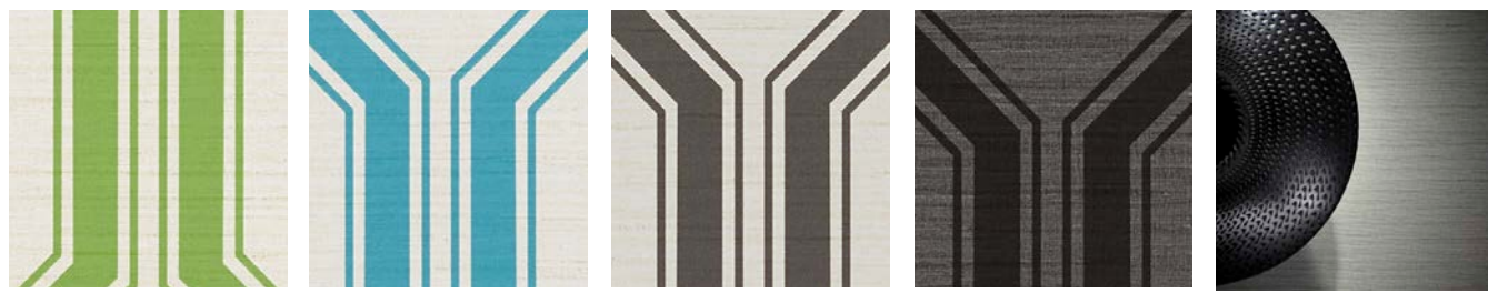
DN2-STR-12 Montauk Lawn Club DN2-STR-13 Montauk South Shore DN2-STR-14 Montauk Tar DN2-STR-15 Tar Black