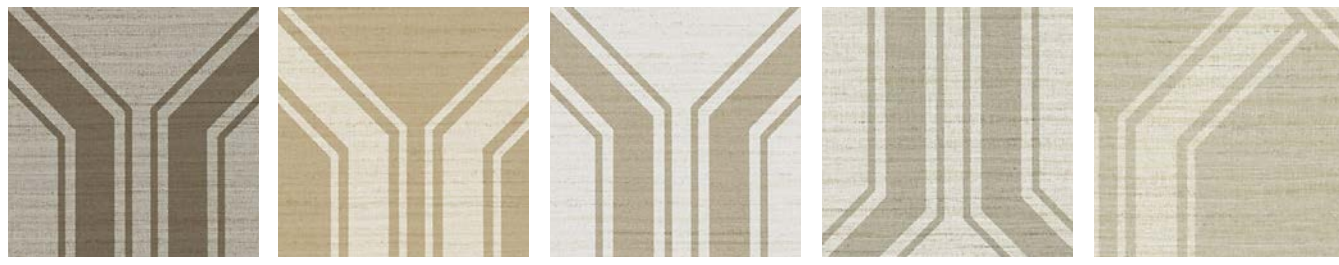
DN2-STR-01 Kabri Pottery DN2-STR-02 Almond Biscuit DN2-STR-03 Montauk Pongee DN2-STR-04 Ecrú Flax DN2-STR-05 Ecrú Dovetail