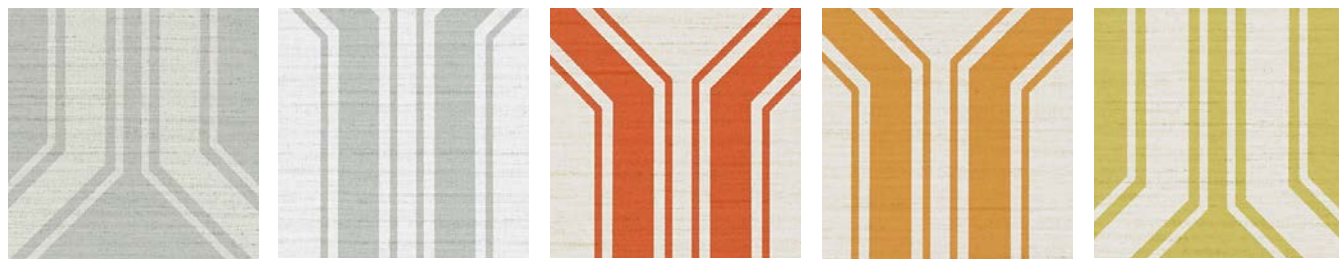
DN2-STR-06 Salt Haze Shadow DN2-STR-07 Lucent Sanctuary DN2-STR-09 Montauk Lobster Roll DN2-STR-10 Montauk Clementine DN2-STR-11 Montauk Daisy