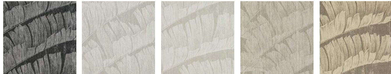
DN2-PAW-06 Garden Gate DN2-PAW-07 Hammock DN2-PAW-08 Plantation DN2-PAW-09 Beach Front DN2-PAW-10 Grand Strand