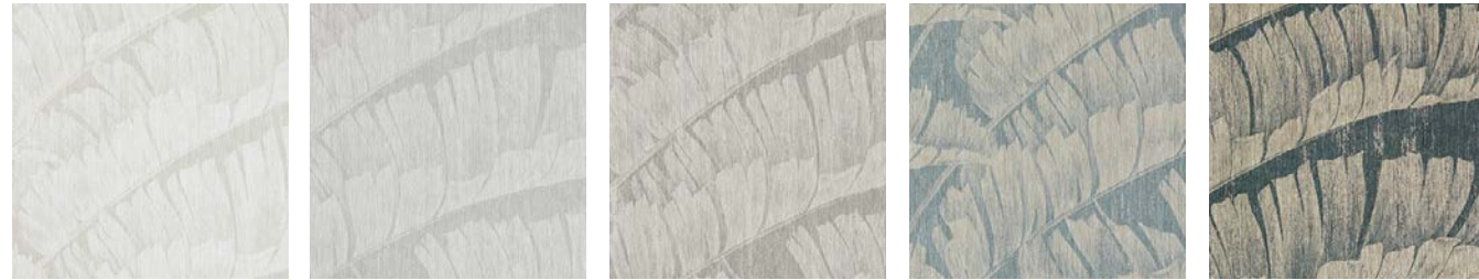
DN2-PAW-01 Egret DN2-PAW-02 Breeze DN2-PAW-03 Oyster Bar DN2-PAW-04 Surf & Sand DN2-PAW-05 Murrells Inlet