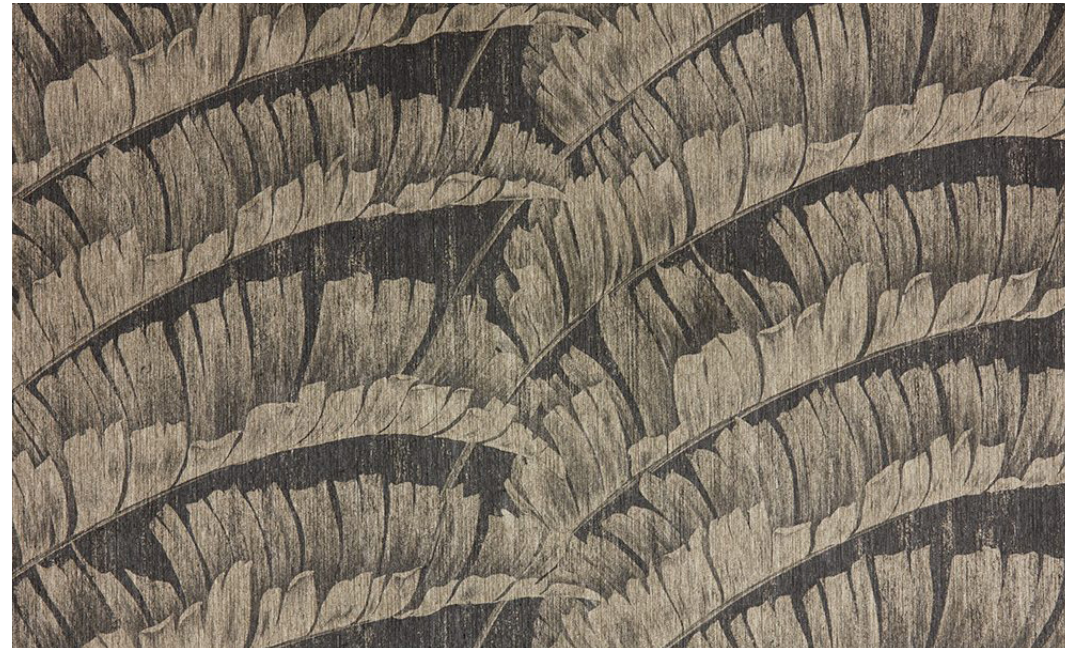
DN2-PAW-11 Marsh Creek