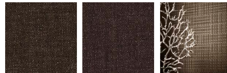
DN2-MTU-21 Molten Brown DN2-MTU-22 Black Orchid FOR SIMILAR TEXTURES CLICK HERE

Type II 20 oz | Width: 52"/54" | Backing: Non-Woven | Match: Random Match Non-Reversible Pattern Repeat 52"H x 24"V | Fire Rating: Class A | Flame Spread: 25 | Smoke Development: 55