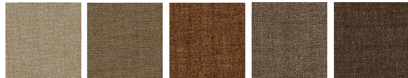
DN2-MTU-16 Golden Touch DN2-MTU-17 Gilded Burlap DN2-MTU-18 Eartha DN2-MTU-19 Polished Stone DN2-MTU-20 Bronze