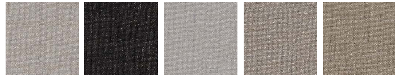
DN2-MTU-11 Lux Linen DN2-MTU-12 Pitch Perfect DN2-MTU-13 Carte Blanche DN2-MTU-14 Mesmerize DN2-MTU-15 Prosecco