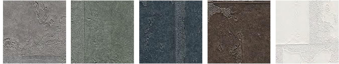
CD2-MAG-06 Delfino CD2-MAG-07 Verde Oliva CD2-MAG-08 Belle Notte CD2-MAG-09 Saturina CD2-MAG-10 Bianco