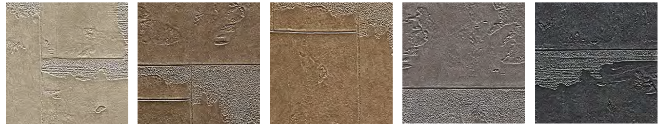
CD2-MAG-16 Cinta Muraria CD2-MAG-17 Castrano CD2-MAG-18Morrone Chiaro CD2-MAG-19 Fortezza CD2-MAG-20 Nero