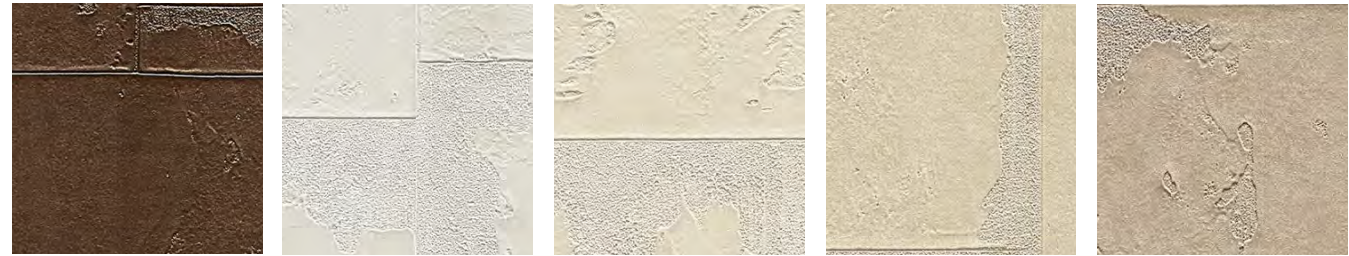
CD2-MAG-11 Bronzo CD2-MAG-12 Gemma CD2-MAG-13 Palazzo CD2-MAG-14 Villa Toscana CD2-MAG-15 San Bruzio