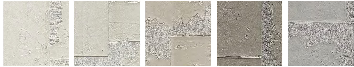
CD2-MAG-01 Fontana CD2-MAG-02 Nebbia CD2-MAG-03 Ciottolo CD2-MAG-04 Pietra CD2-MAG-05 Grigio