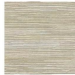
DN2-KRA-11 Origami Paper