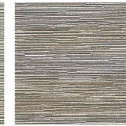
DN2-KRA-05 Tranquility Stone