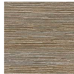
DN2-KRA-16 Guided Taupe