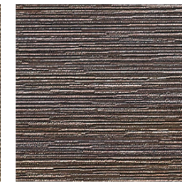
DN2-KRA-18 Raw Amethyst