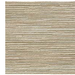
DN2-KRA-12 Sand Garden