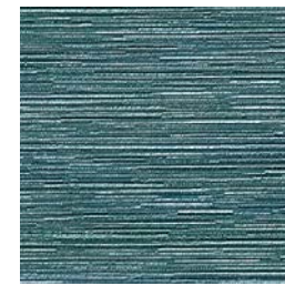
DN2-KRA-07 Lily Pond