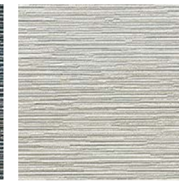
DN2-KRA-09 Shoji White