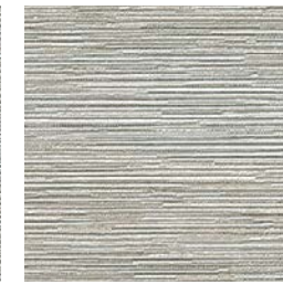
DN2-KRA-03 Pacific Log