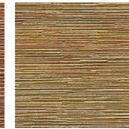
DN2-KRA-15 Koi Gold