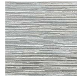
DN2-KRA-02 Snow Moon