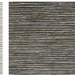
DN2-KRA-10 Black Sand