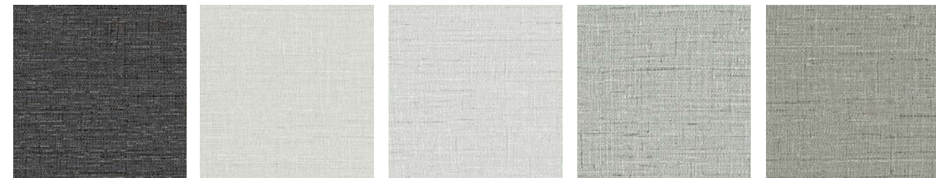
DN2-ELS-27 Hematite DN2-ELS-28 Veil DN2-ELS-29 Shaker White DN2-ELS-30 Sailor DN2-ELS-31 Grey Area