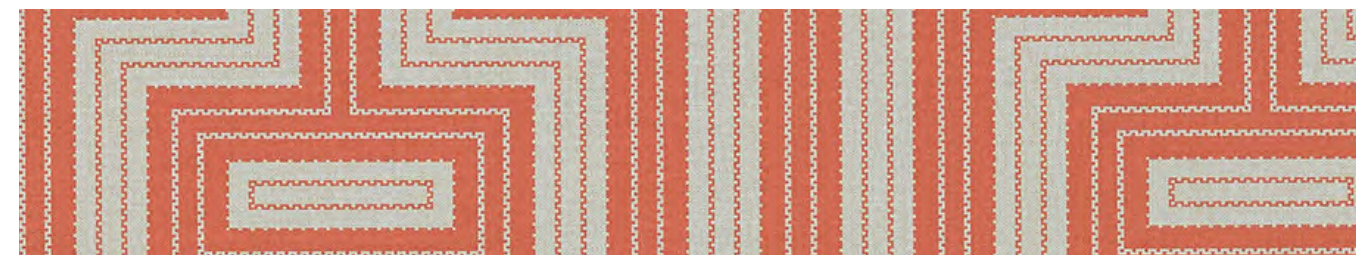
CD2-CFT-11 Petal Off White