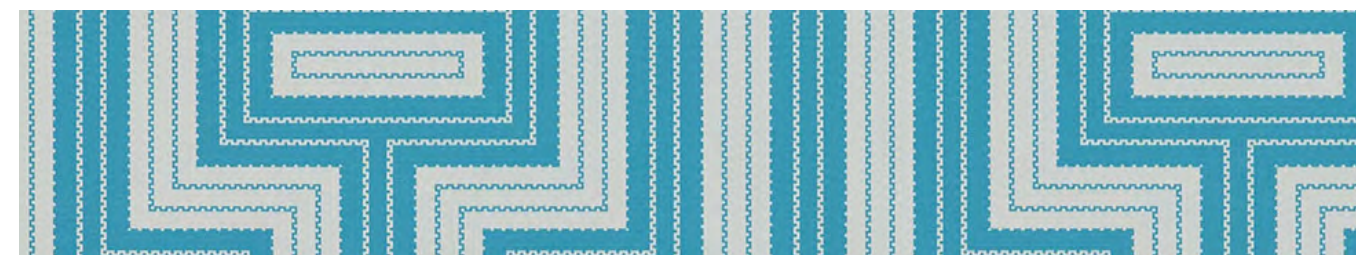
CD2-CFT-12 Aruba Cloud