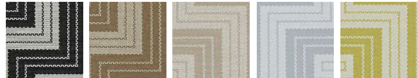
CD2-CFT-06 Gravel Ice CD2-CFT-07 Cocomo Taupe CD2-CFT-08 Oyster Buff CD2-CFT-09 Tiffany Ice CD2-CFT-10 Citrus Moon