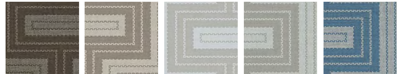
CD2-CFT-01 Woodland Stone CD2-CFT-02 Greige Pebble CD2-CFT-03 Paloma Ice CD2-CFT-04 Shadow Paloma CD2-CFT-05 Chambray Chrome