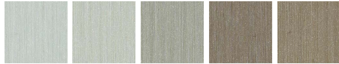
DN2-AST-01 White Frost DN2-AST-02 Dockside DN2-AST-03 Grey Ombre DN2-AST-04 Abby Stone DN2-AST-05 Silt