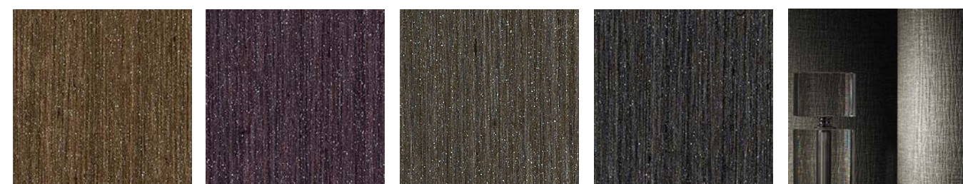
DN2-AST-21 Hazelnut DN2-AST-22 Brunello DN2-AST-23 Peppercorn DN2-AST-24 Black Iron FOR SIMILAR TEXTURES CLICK HERE

Type II 20 oz | Width: 52"/54" | Backing: Non-Woven | Match: Random Match Reversible Pattern Repeat 26"H x 24"V | Fire Rating: Class A | Flame Spread: 10 | Smoke Development: 10