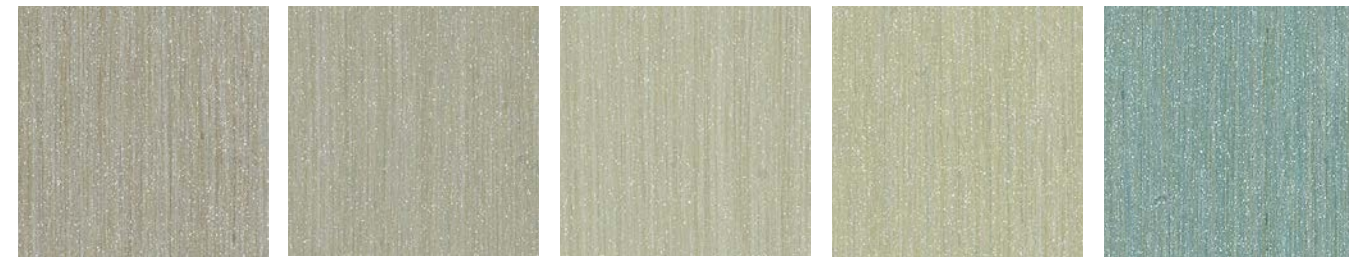
DN2-AST-06 Urban Putty DN2-AST-07 Dovecoat DN2-AST-08 Canyon Cloud DN2-AST-09 Mint Sorbet DN2-AST-10 Sail Away