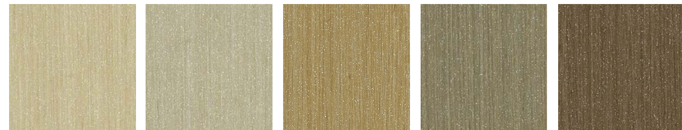
DN2-AST-16 Pecorino DN2-AST-17 Fallow DN2-AST-18 Final Straw DN2-AST-19 Olivine DN2-AST-20 Arrowhead